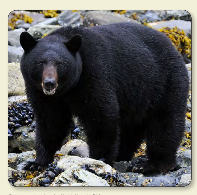
Photograph taken by Keith Hatch, BIA Photographs without credit are public domain.